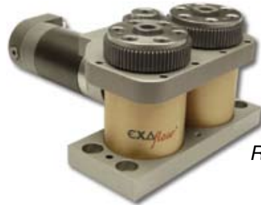
TWIN RIGHT ANGLE DRIVE UNIT

NEW - "NGTA" type compact unscrewing device shows its merits in two molding applications. The upstanding cores (marked red) are passed through the telescopic sleeve and secured against turning behind the unscrewing device. Unique thru-hole is ideal for threaded core cooling. (marked blue).